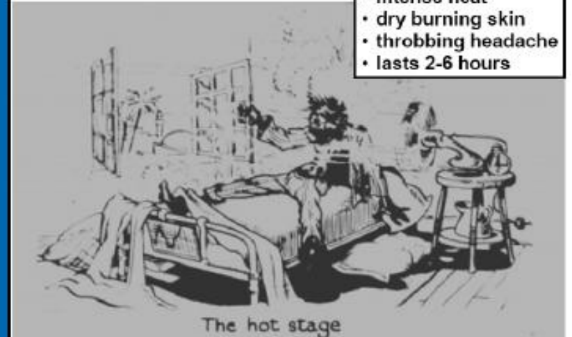
The hot stage